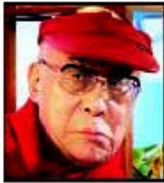
CHINA A FACTOR?

Sources said the final decision could still take a few weeks, the main reason being Prime Minister Manmohan Singh's scheduled meeting with his Chinese counterpart Wen Jiabao on the sidelines of ASEAN summit later this month. Fearing a sharp response from Beijing, the government clearly does not want any awkward moment just ahead of the meeting.